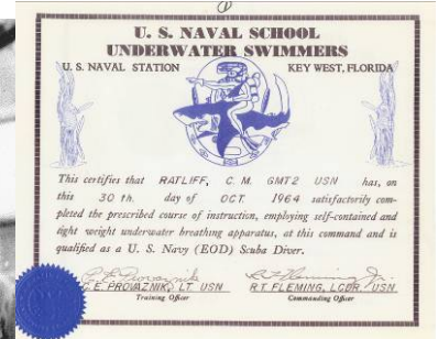
Class of October 1964.