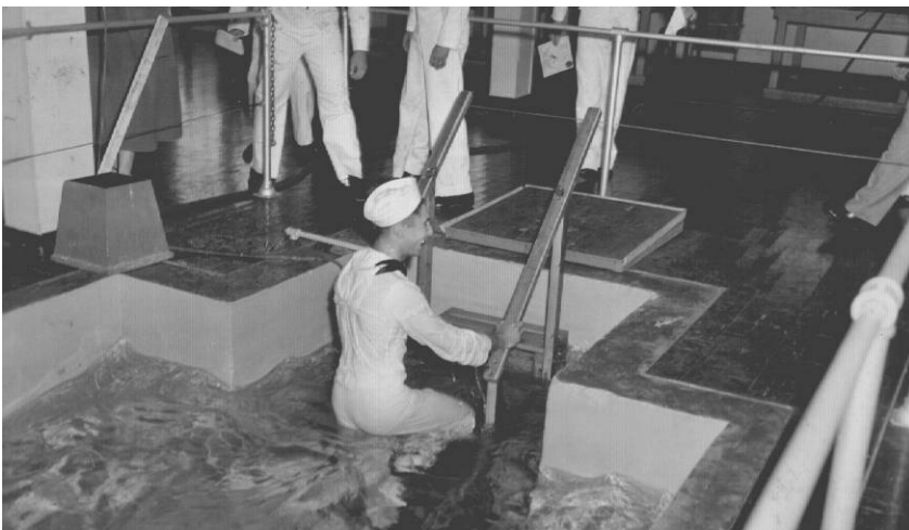
What goes around comes around