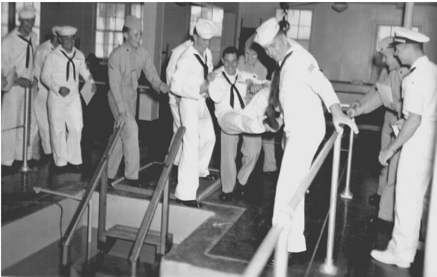
Students show their appreciation at graduation