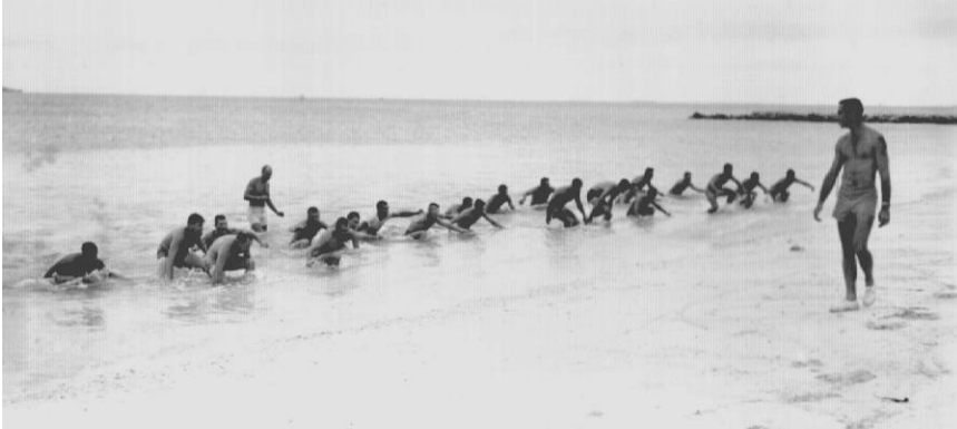
Class Procter monitors wet PT