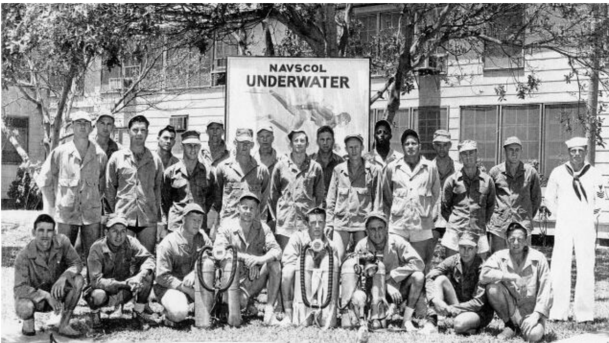
Class of March-May 1959

The course of the shark project did not run smooth; there were mistakes and occasional false leads. Moreover, the shark itself lost a bit of its identity somewhere along the way. As it stands, it combines characteristics of not only the fine-tooth but also the mako, sand and nurse shark varieties. One characteristic remained intact from the start, however. It is, Byers states emphatically, a female.