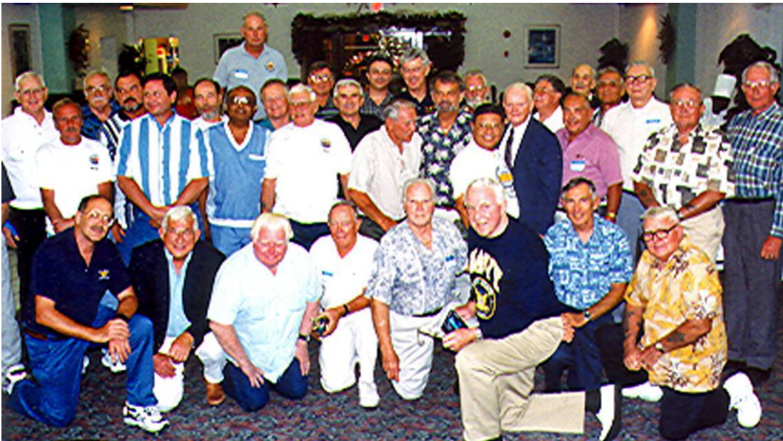
First Reunion Key West 1998

Fraternal Order of Underwater Swimmers School Buddy Line Newsletter 1440 S. W. 5 th Avenue Boca Raton, FL 33432