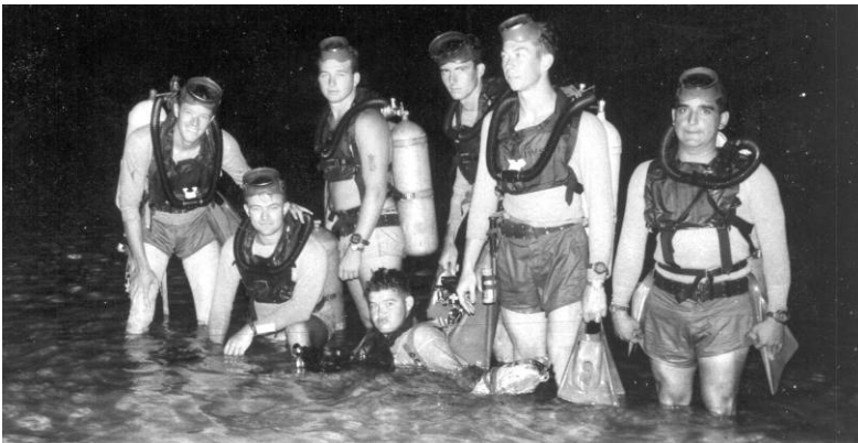
1000 yard night swim

The material in the Najaf Chronicles is not for public use and may not be re-printed or used in any other context.