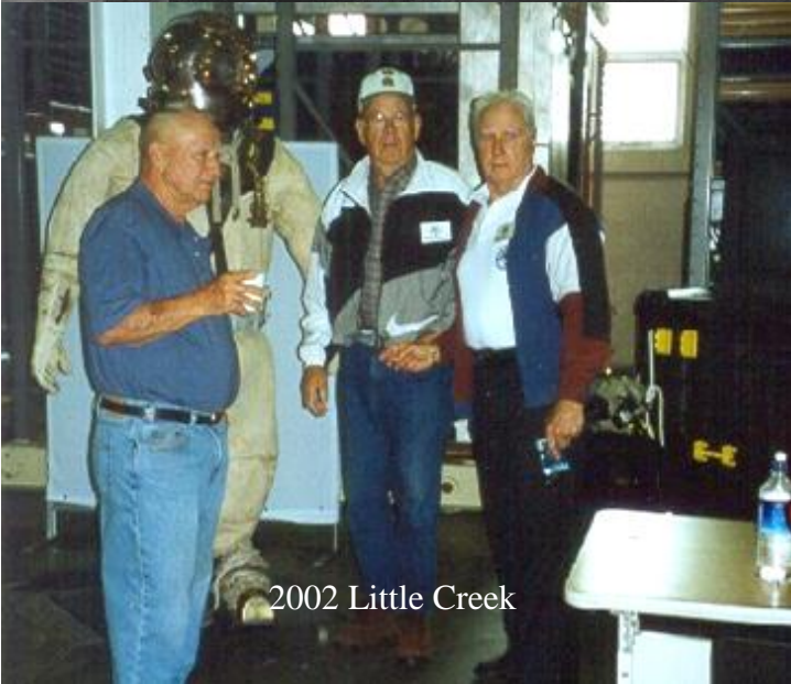
2002 Little Creek