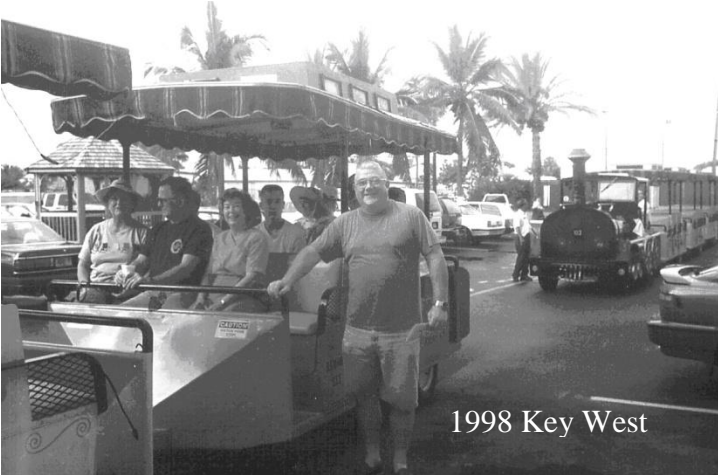
1998 Key West