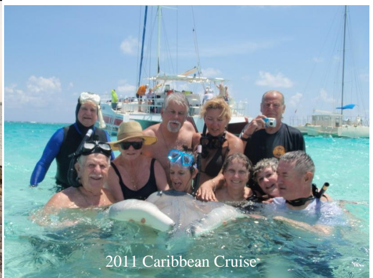
2011 Caribbean Cruise