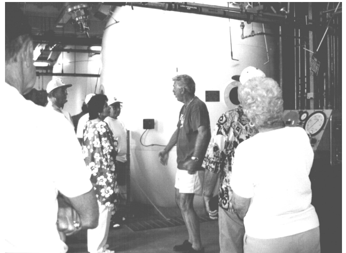
EDU – Panama City Beach 2000

and additional activities you would enjoy, such as picnic, fishing trip, golf, swim, run, walk, crawl, you name it and we'll consider it.