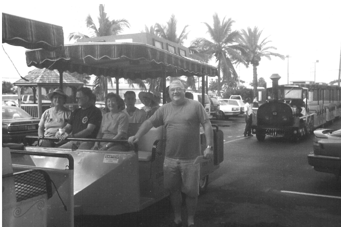
Conch Tour Train - Key West 1998