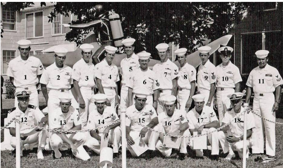
Class of April 1969

The material in the Najaf Chronicles is not for public use and may not be re-printed or used in any other context.