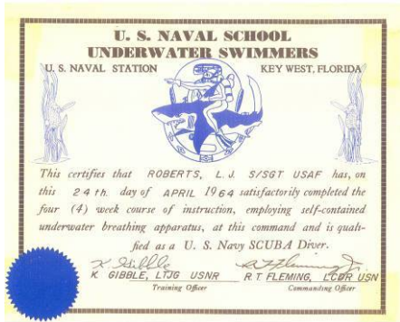
Class of April 1964