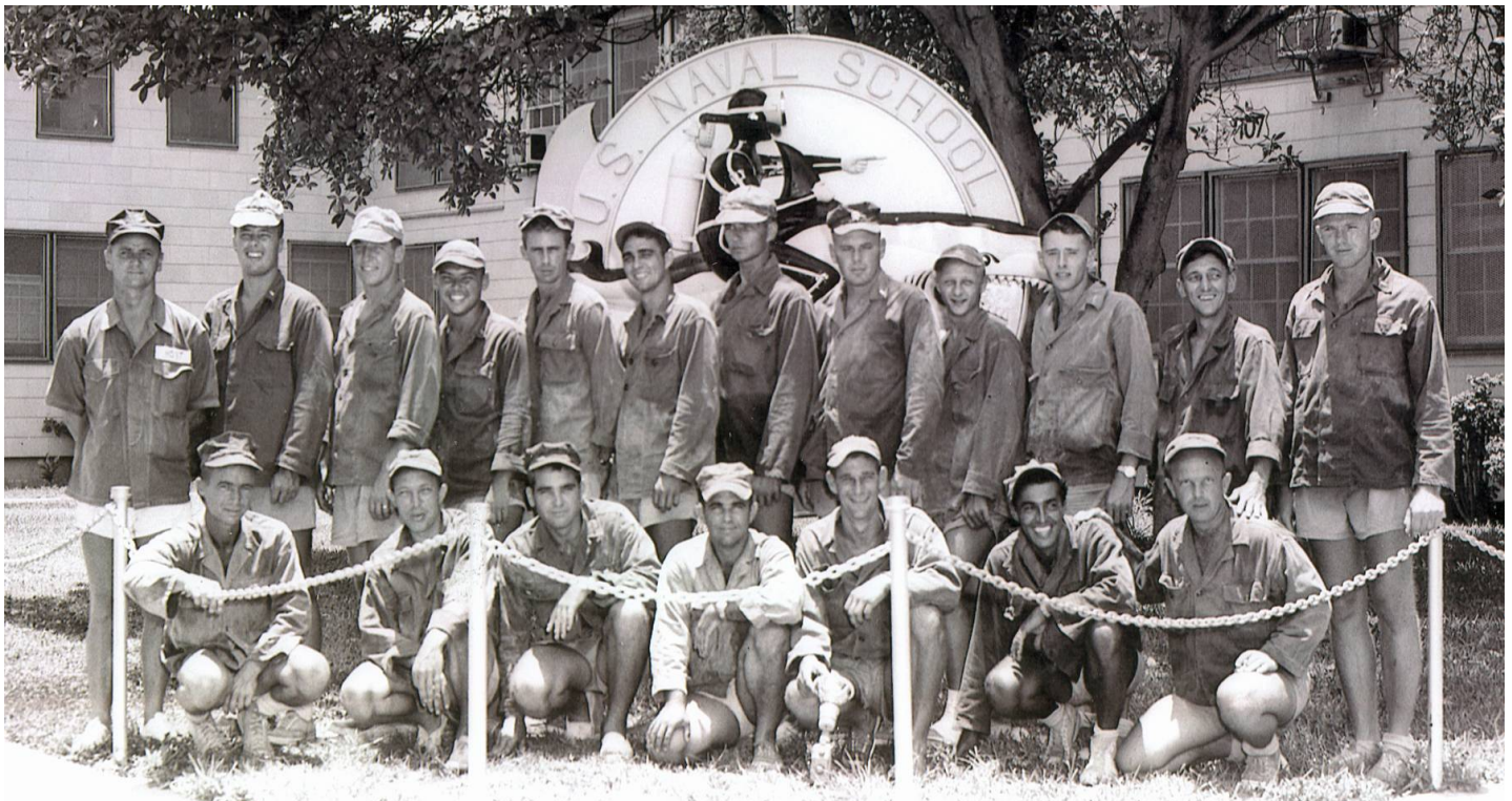
EOD Class of July 1963