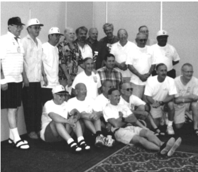
Some of the guys gathered for a group picture...

Did he say you only have to come up every four years to reenlist?