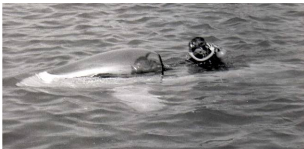
Is this swimmer riding a SPU or an SDV?