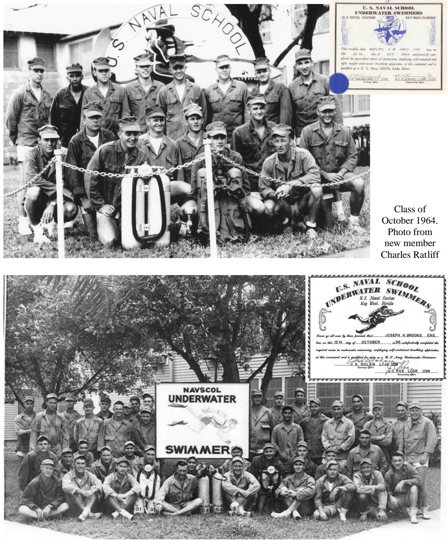
Class of October 1956