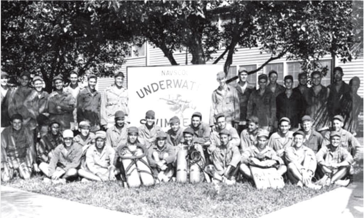
Underwater Swimmers School Key West Class of 1955