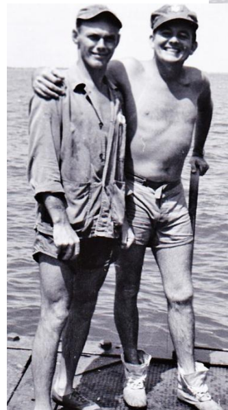
Crowell & Huett?