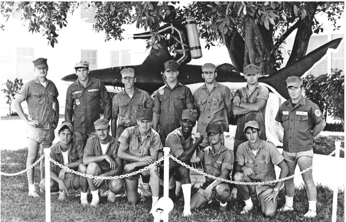
UWSS Class June 1973