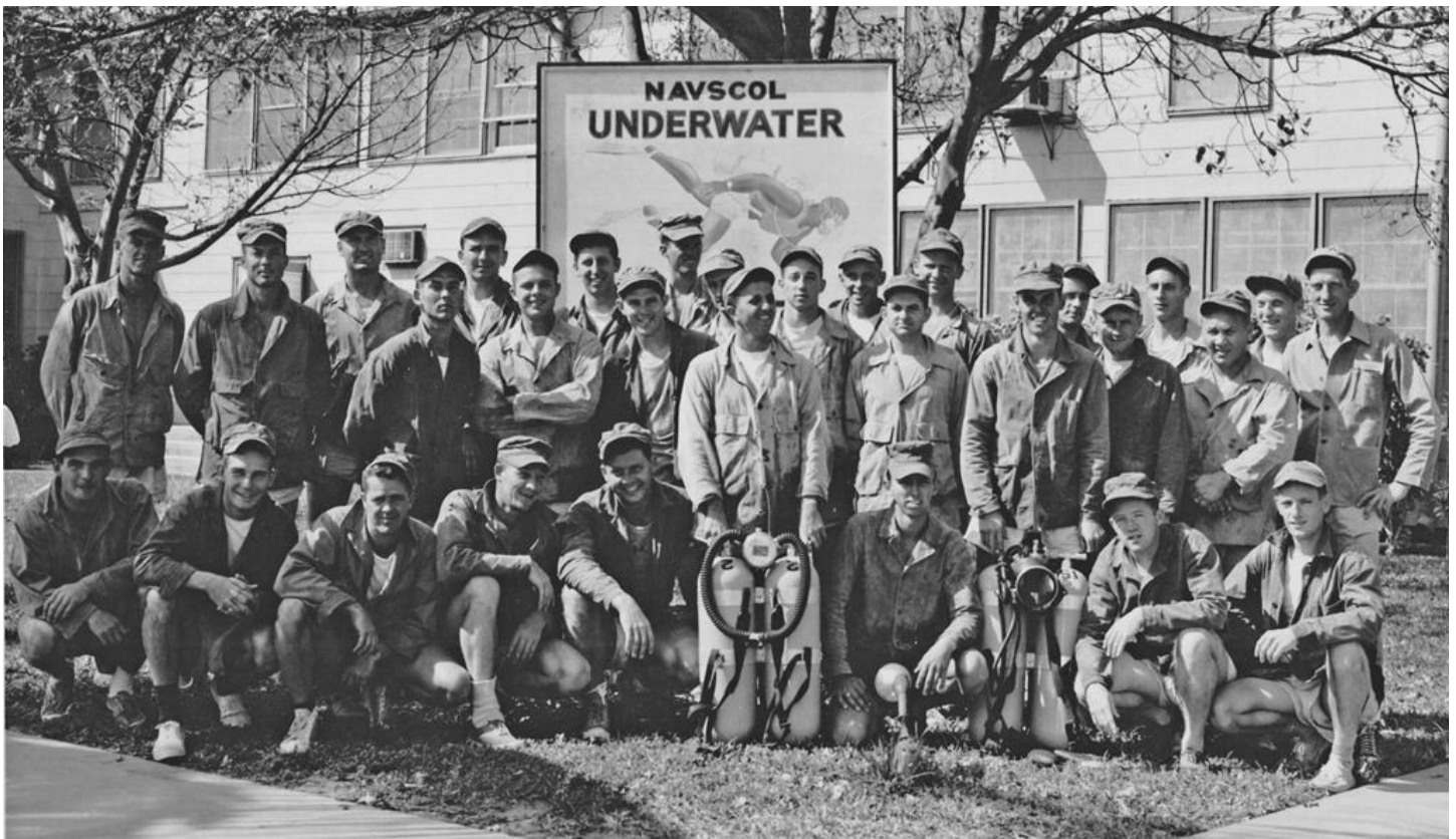
UWSS Class February 1960