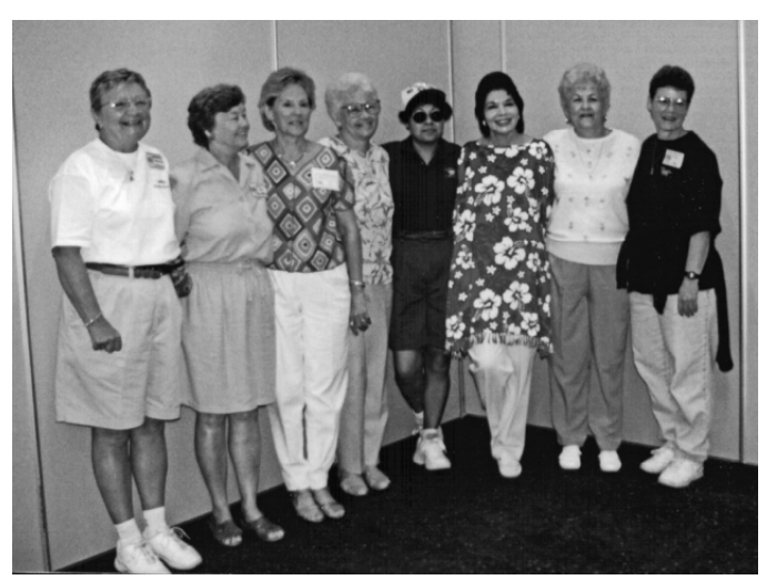
And so did the ladies.