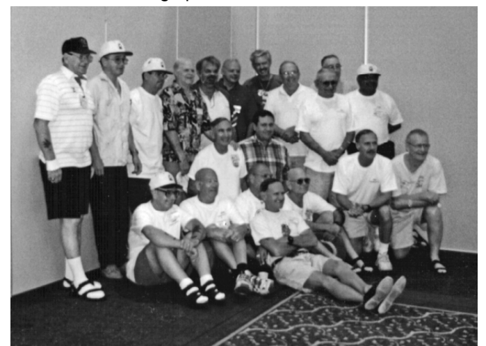
Some of the guys gathered for a group picture...