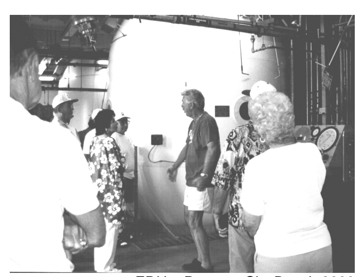
EDU - Panama City Beach 2000

and additional activities you would enjoy, such as picnic, fishing trip, golf, swim, run, walk, crawl, you name it and we'll consider it.