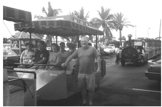
Conch Tour Train - Key West 1998

Do most of you want to repeat a three day format,