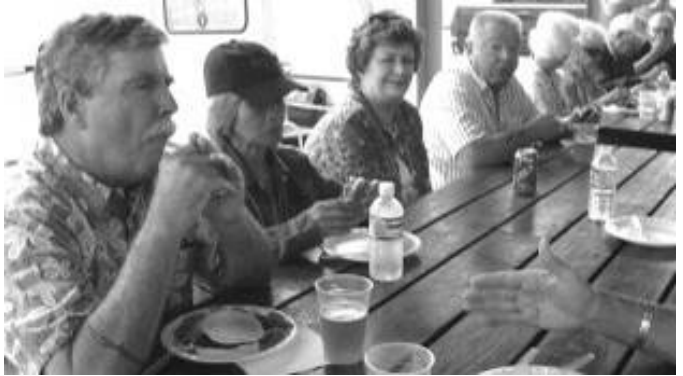
Many toured the CDU facility where they admired both the interesting historic displays and the modern gear.

Activities started off at noon on Friday, May 7<sup>th</sup> at a cookout with the officers and crew of the Consolidated Diving Unit on the 32<sup>nd</sup> Street Navy Base in San Diego. The members of FO/UWSS enjoyed some great food and swapped stories with the active duty divers.