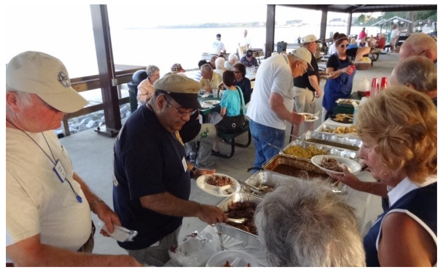
The food was great but the highlight of the night was the fundraiser auction. Many had donated memorabilia such as blasting machines, compass, life vest, depth gauge. Others donated books, posters ceramics, glass logo. The auction raised $1300 which will be donated to funds helping EOD and SEAL wounded warriors