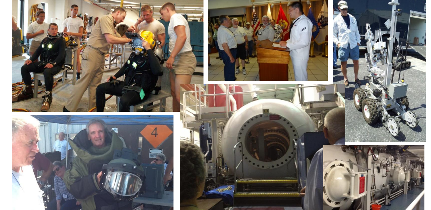
Dive School, Experimental Diving Unit, NSA Dive Locker, EOD Locker