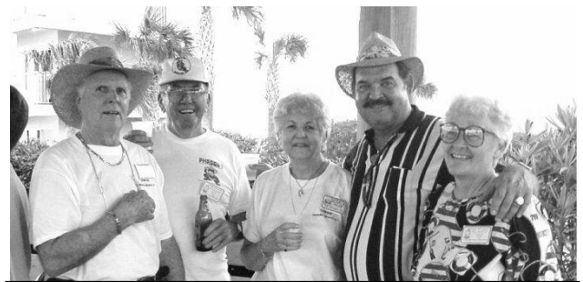
Reunion 2000 Panama City Beach. The Fraternal Order of Underwater Swim School was created at this reunion.