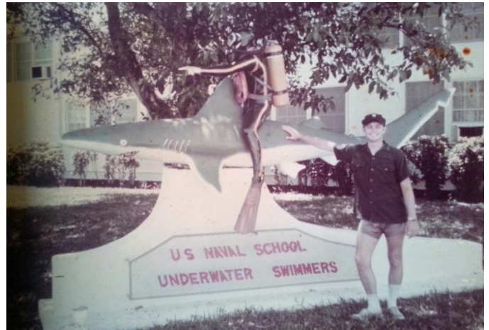
This would have been close to graduation in August of '71. That's why I'm smiling. Notice the shiny "Butter Bar" on my collar. I'd been in the Navy all of about 7 months. Really salty.

I may have misspelled some of the names and forgotten a few. Please forgive the mistakes.