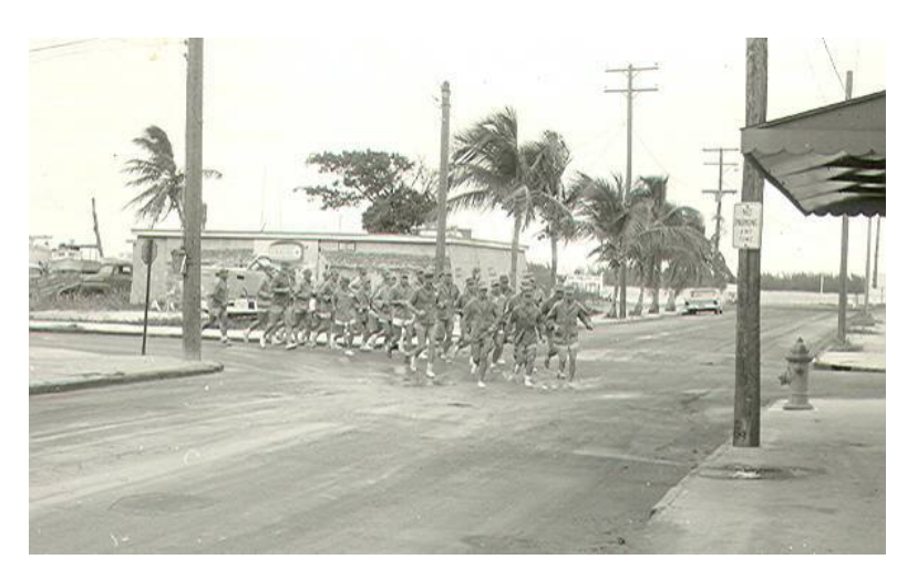
Run through town - 1958