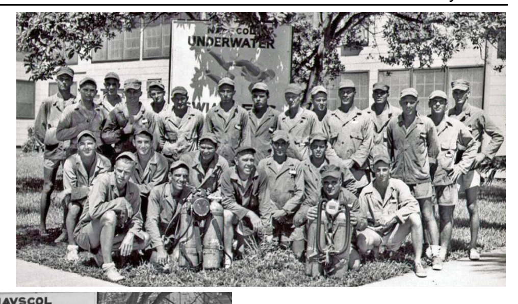
NAVSCOL UNDERWATER SW MAP RS